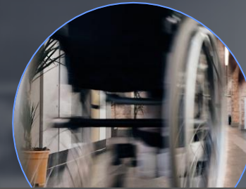
UX-Design for Inclusion & Accessibility