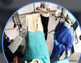
Evaluation & Usability Testing CPUX-UT