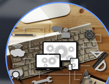
User Requirements Engineering CPUX-UR