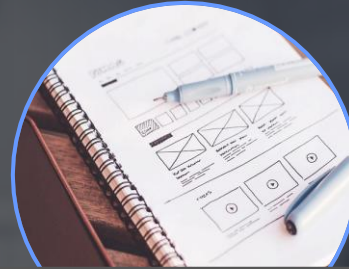
Fundamentals of Usability Engineering CPUX-F